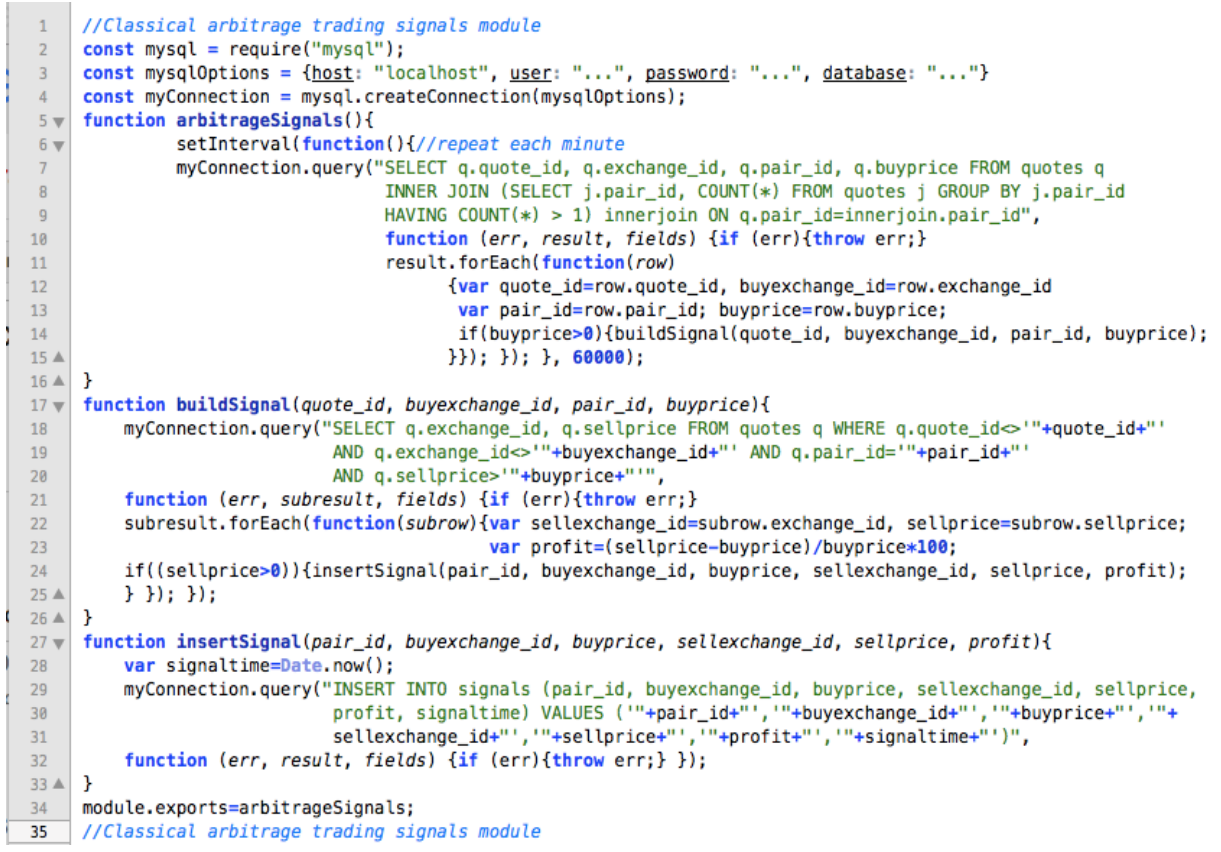
Fig. 2. node.js callback functions for the classical arbitrage trading signals module.

In the second case it was implemented an SQL procedure to build the arbitrage trading signals with the same amount of data. The results using SQL are conclusive; the time response was about 0.25 seconds which is a realistic time for the trading software. In Figure 2 is presented a sample code for node.js using callback functions and SQL to build the arbitrage trading signals.