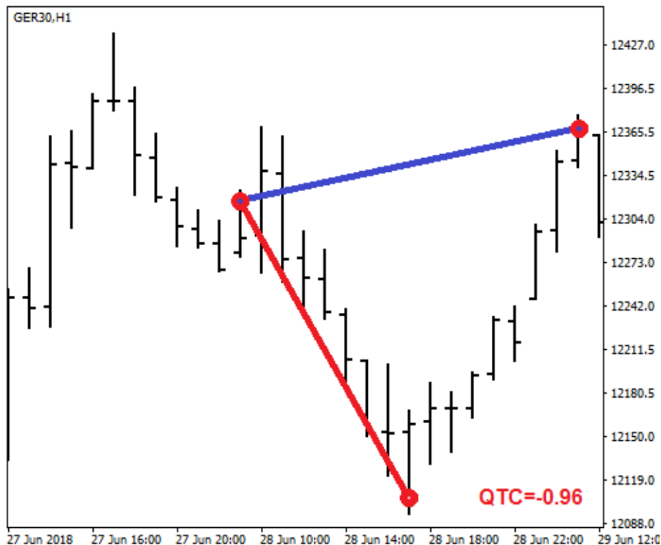
Fig. 4. Loss trade far away the perfect trade