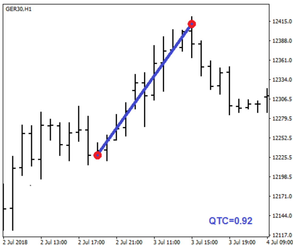
Fig. 2. Profitable trade close to the perfect trade

by TheDaxInvestor [8], an automated investment software. The trade was opened on 2 nd July at 17:06 at 12,220 price level with an initial target established at 12,346 and moved during the trade at 12,398. On the entire period of the trade the QTC has positive values. The minimum value for the QTC was 0.57 and the maximum values was 0.92. As it can be seen in the fig. 2, the price levels were close to the perfect trajectory, there were no substantial retracements and the price trend was continuously up approaching the target in any time interval. This is a good example for a trade very close to the perfect trade.