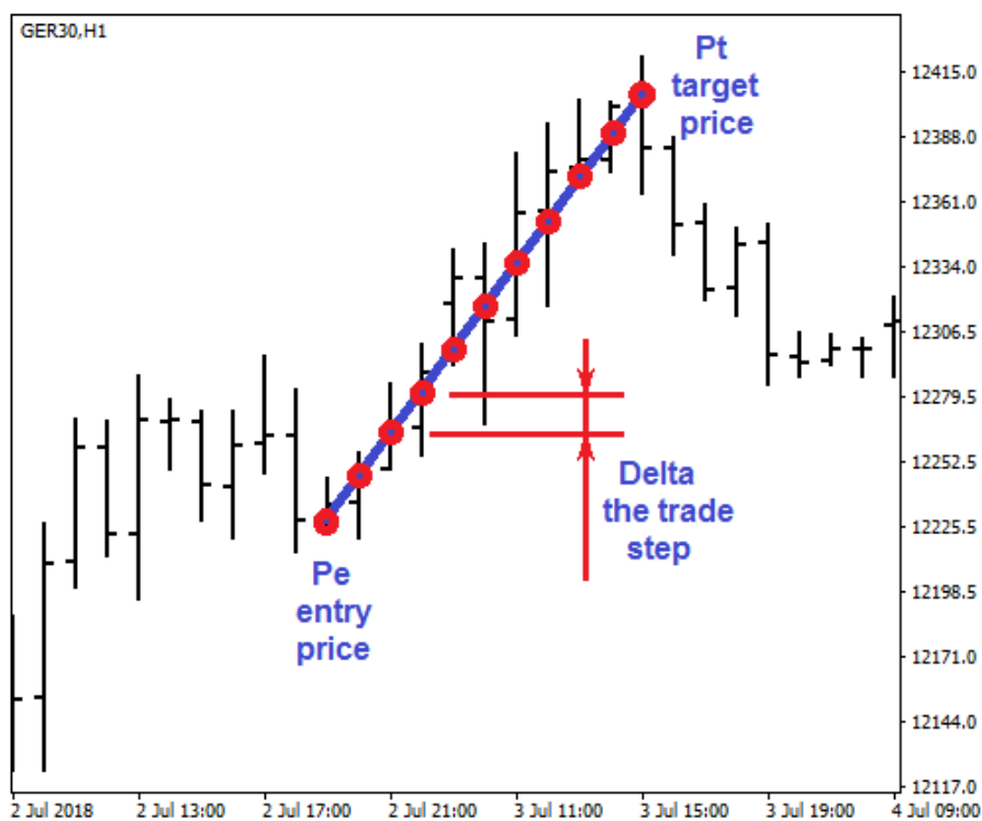
Fig. 1. The perfect trade

In order to build the QTC the current trade will be compared with a perfect imaginary trade. This kind of trade is hypothetical and rarely exists in the current practice. However, this trade exists in the mind of traders and investors as to be the wish of anyone. In the perfect trade, once the transaction was opened, the price goes continuous up and evolves with the same speed in each time interval until the profit target is reached.