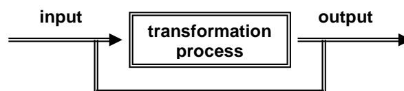
Fig. 1. Economic System

An economic system receives an input of production factors. This input is processed and an output is provided in the shape of products and services provided to the market. The accurate transformation of the input into output is made by a feedback loop , figure 1.