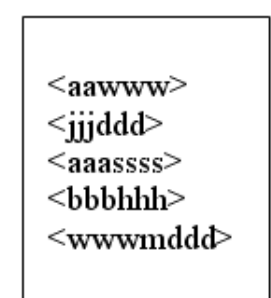
Figure 1 – The entity E

In picture 1 is being presented the content of the E entity, content that is subject to checking, in order to determine the internal orthogonality of the entity.